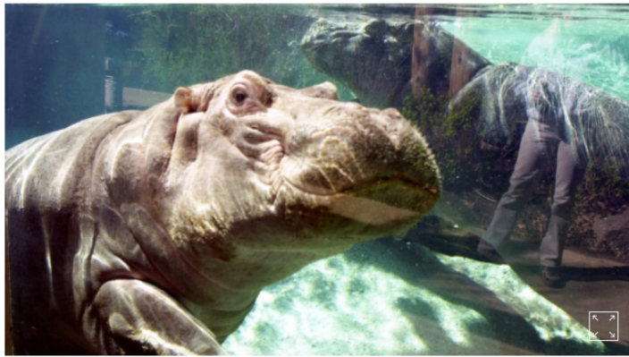
Bibi, a three year-old Nile hippopotamus at the St. Louis Zoo in St. Louis, April 25, 2002.